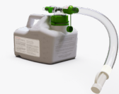
Jerry Can Spout Extension